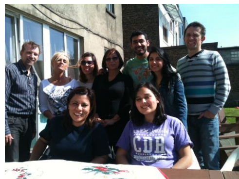
Argentinian team visits Belgium.

With prayer and fasting for revival, we joined efforts with 7 churches to reach out to our city. Many brought friends and family. Hearts were changed by the presence of God. Ministry times were strong with repentance and freedom from sin, sickness and discouragement.